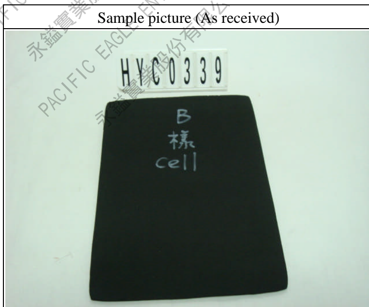
Sample picture (As received)